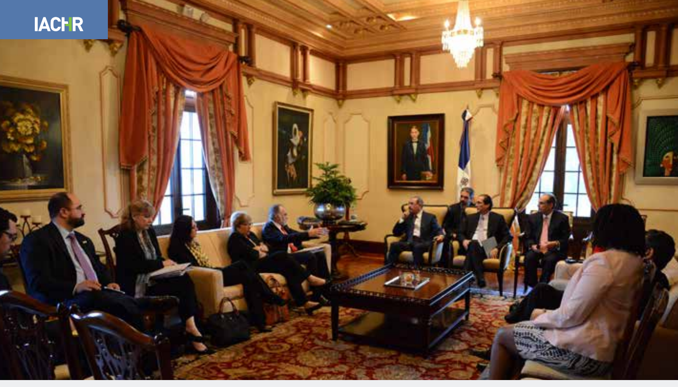
IACHR's meeting with the President of Dominican Republic, Danilo Medina Sánchez; Minister of the Presidency, Gustavo Adolfo Montalvo; and Minister of Foreign Affairs, José Manuel Trullols

The IACHR held meetings with State authorities, civil society organizations, victims of human rights violations, and representatives of international agencies. During the visit, various IACHR delegations visited the provinces of Bahoruco, Dajabón, Independencia, La Romana, San Cristobal, San Pedro de Macorís, Santo Domingo, and Valverde.