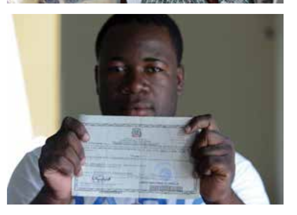
Affected persons who gave their testimony before the IACHR in San Pedro de Macorís and Santo Domingo \,

Along these lines, the obligations rooted in international human rights law require that States refrain from applying policies, laws, judgments, or practices that result in people being unable to have access to any nationality, as the Inter-American Court established in the Case of the Girls Yean and Bosico, in its judgment of September 8, 2005. That judgment also establishes that when there is a risk of statelessness, the person who might be affected need prove only that he or she was born in the territory of the State in question to obtain the respective nationality.