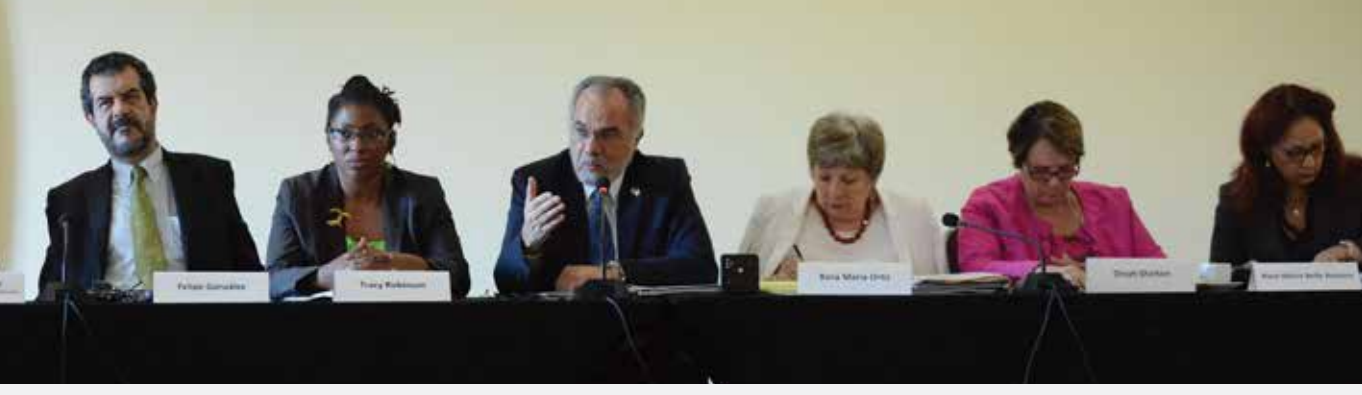
Members of the Inter-American Commission on Human Rights meeting with civil society organizations in Santo Domingo

Authorities from the executive and legislative branches stated to the Inter-American Commission that they recognize that a problem exists with respect to the exercise of the right to nationality by Domicans of Haitian descent and are aware of the need to find a solution. In this regard, in the spirit of working in collaboration to find a solution that is