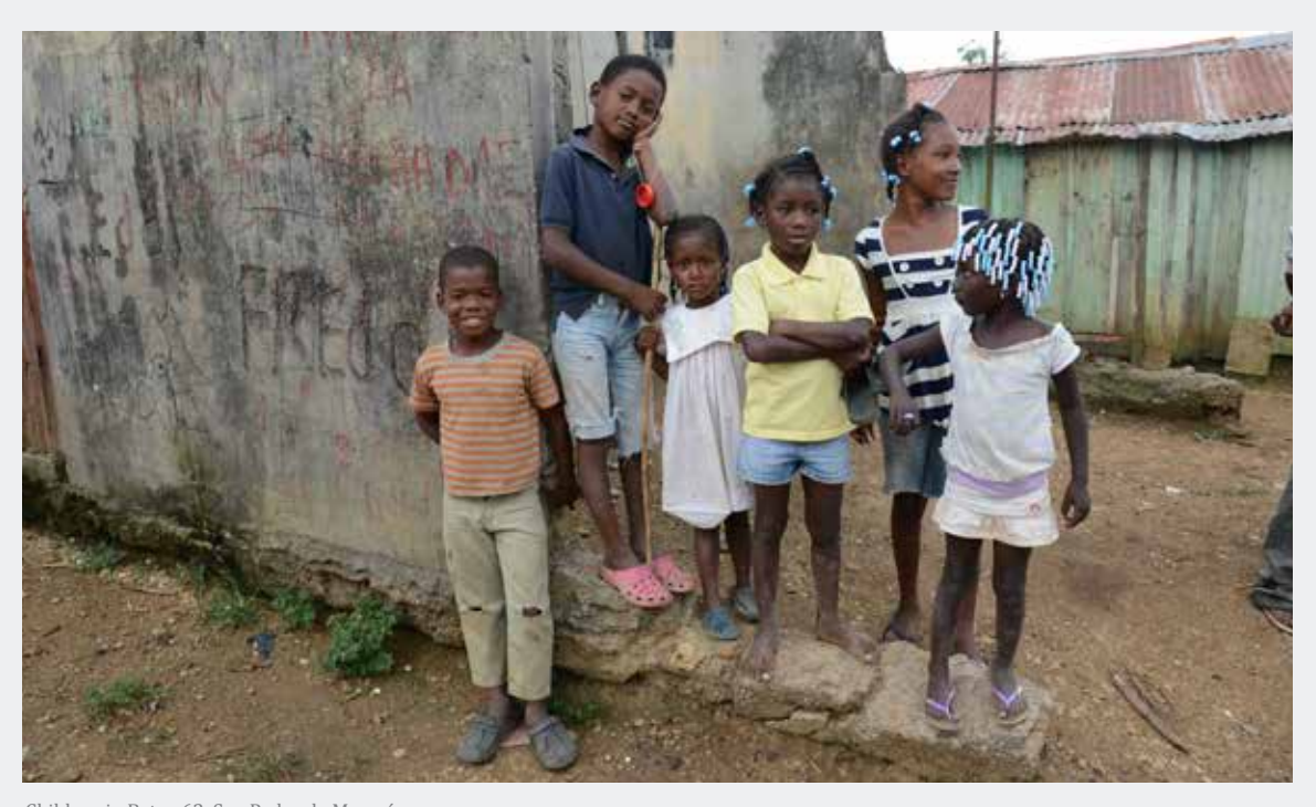
Children in Batey 62, San Pedro de Macorís

In addition, meetings were held with international organizations, including the Office of the United Nations High Commissioner for Refugees (UNHCR), UN Women, UNAIDS, the World Bank, the International Labour Organization (ILO), the Food and Agricultural Organization (FAO), and the Pan American Health Organization (PAHO). In addition, the Commission met with various journalists, legal experts, university personnel, and victims of human rights violations.