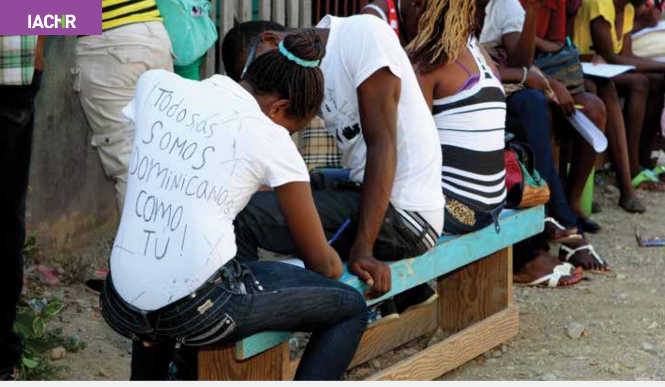
Affected persons in the Liberty Batey, Valverde province

The Inter-American Commission notes that in a context of deep societal polarization, the album and the slogan "death to the traitors" would seem to constitute a direct call, collectively and without euphemisms, for the killing of clearly identified or identifiable individuals. In this regard, the Inter-American Commission calls to mind that these types of statements could constitute incitements to violence, given the context in which they were disseminated.