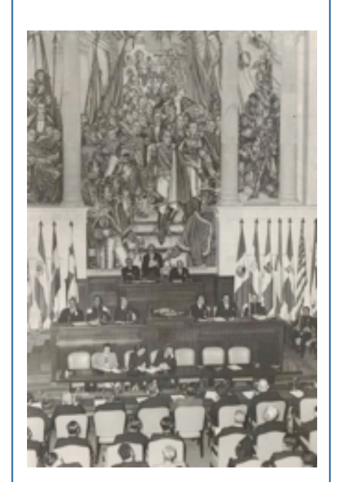
"In Colombia, at the inception of the Organization of the American States, hemispheric nations gather to denounce intervention."

"A human being has the right to live with dignity, equality and security. There cannot be security without real peace, and peace must be built on the firm foundation of human rights."