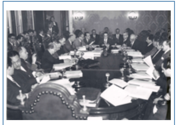
"The Pan-American Union gathers to discuss mechanisms for guaranteeing regional peace."

On the same pacific trajectory of conflict resolution, the regional leaders also constructed the Inter-American Treaty on