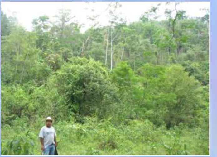
Forest at Finca La Esmeralda