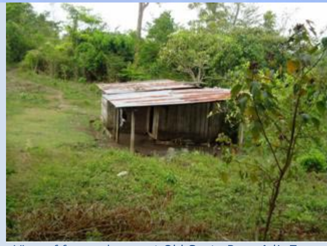
View of former house at Old Santa Rosa Adj. Zone