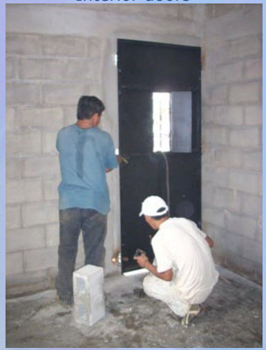
Installing entrance door