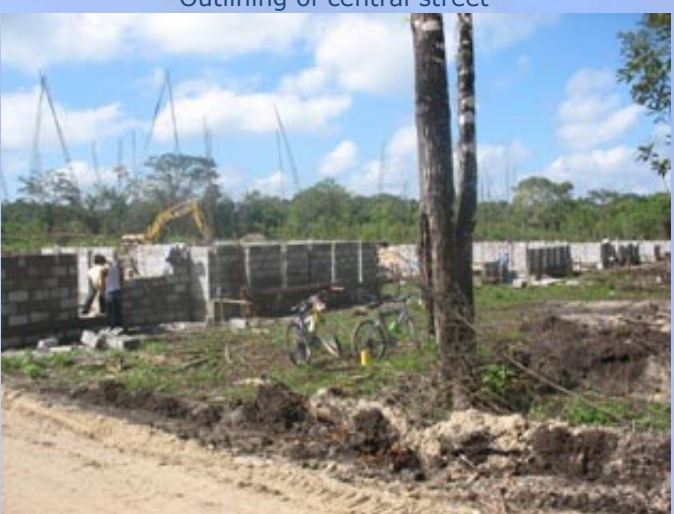
Rear view of construction