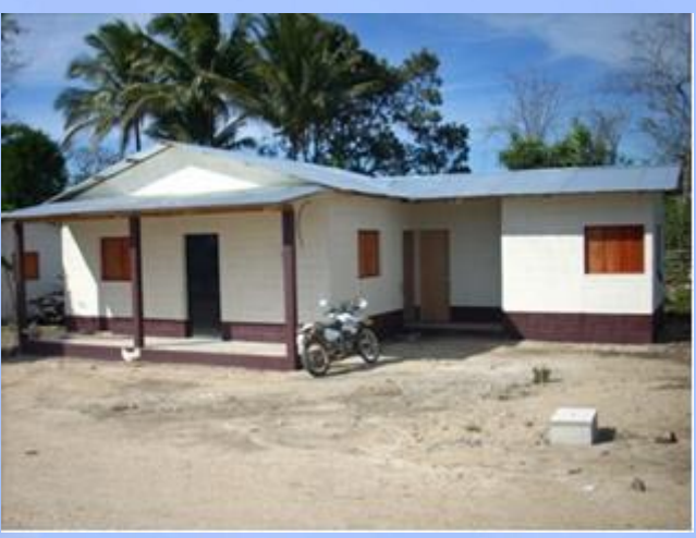
House of one of the beneficiaries