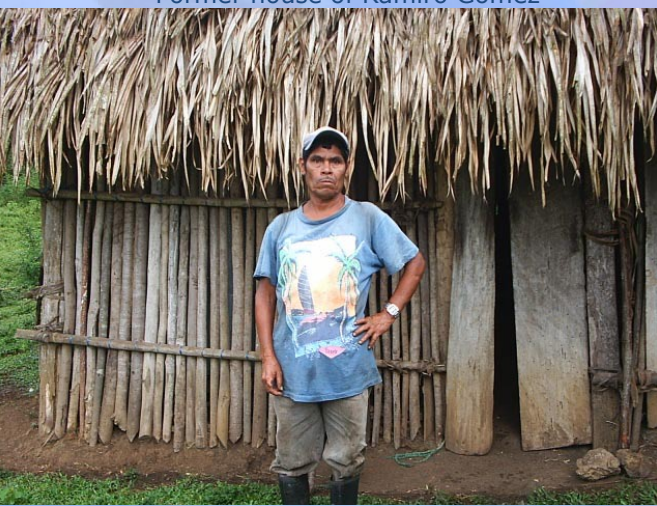
Former house of Pedro Pascual