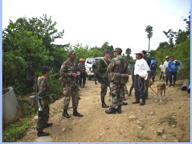
Military support from Belize and Guatemala