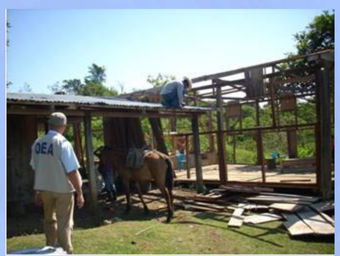
Dismantling of former house