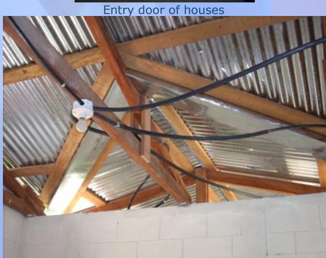
Roofing of houses with electric wiring