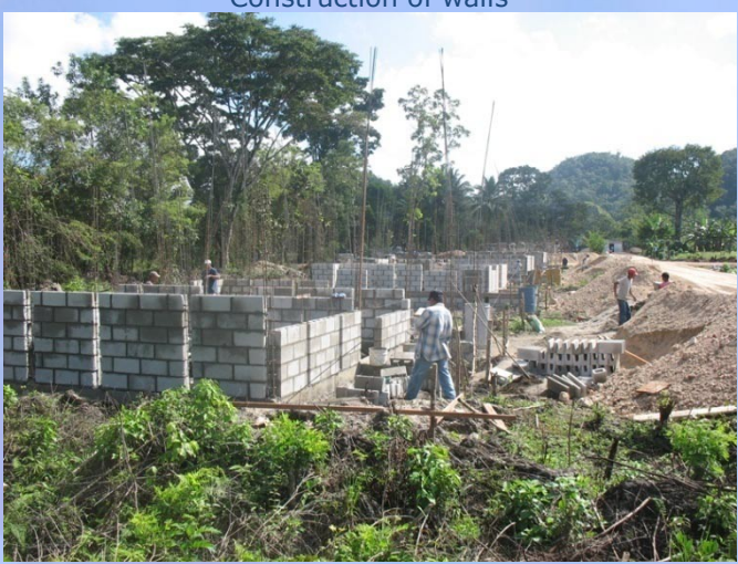
Front view of construction