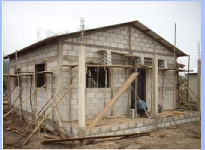
Construction of house in final phase