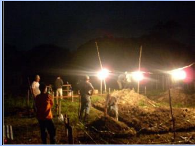
Labouring in the night hours