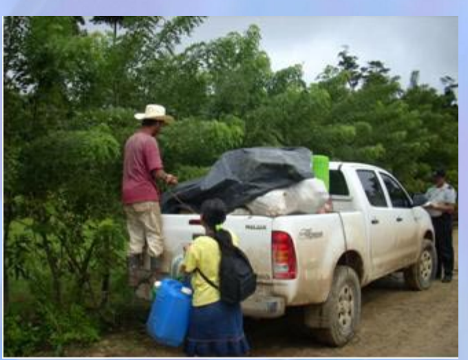
Transfer of belongings