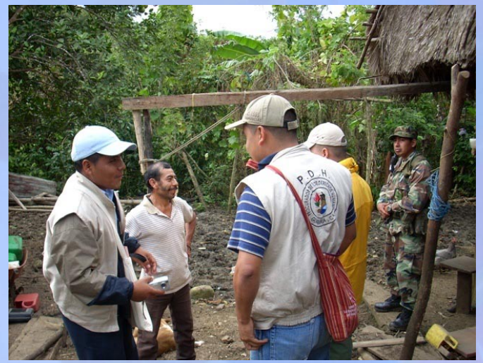
Support from Human Rights, Guatemala