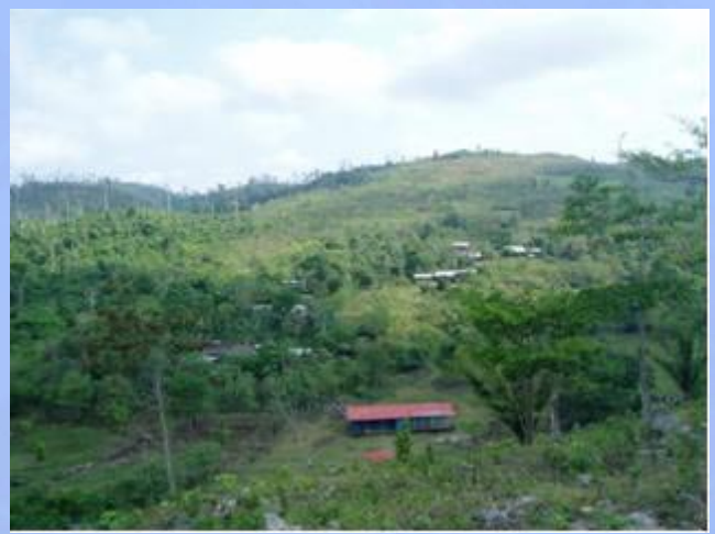
Panoramic view of Old Santa Rosa