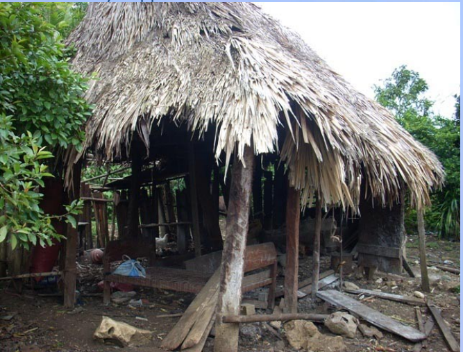
Dismantling of former house