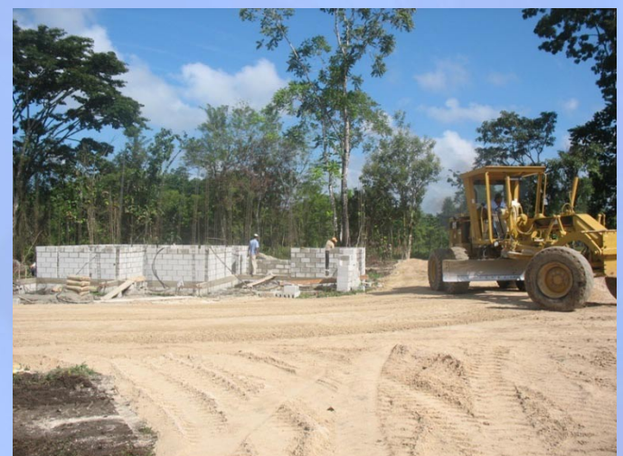
Outlining of central street