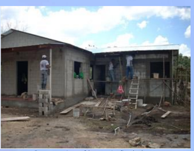
Construction of house in final phase