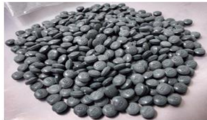
Figure 2: Fentanyl in pill form.