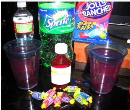
Purple Drink (Lean)