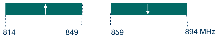
Figure 1. Settlement of frequencies in the band 814-849/859-894 MHz

1. That CITEL Member Administrations planning to expand the range of frequencies for mobile broadband services in the 806-894 MHz band, do so according to the frequency arrangement shown in the following Figure 1.