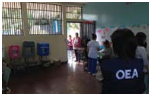
Election Day. Tegucigalpa, Honduras

On March 12, three political parties (Libre, Nacional and Liberal) held primary elections to decide which candidates would compete in the November general elections. In the context of the OAS Electoral Observation Mission for the general elections, the Organization's Department of Electoral Cooperation and Observation deployed a technical delegation of five experts to Honduras. The team held meetings with the different actors of the electoral process and observed the voting on election day. The information gathered during the primary elections served as input to the Mission deployed in November.