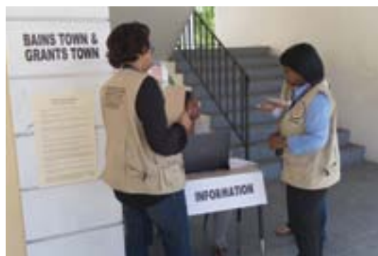
Election Day. Nassau, Bahamas

* http://scm.oas.org/pdfs/2017/CP38494EREPORTMOAS.pdf