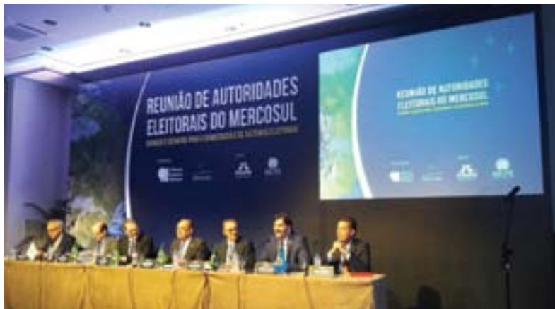
Meeting of MERCOSUR's Electoral Authorities. Foz do Iguaçu, Brazil - September 2017

DECO signed agreements of cooperation and information and knowledge exchange with: