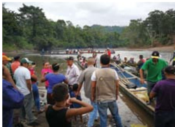
Distribution of electoral material. Jinotega, Nicaragua

* http://scm.oas.org/Pdfs/2017/CP38536S.pdf