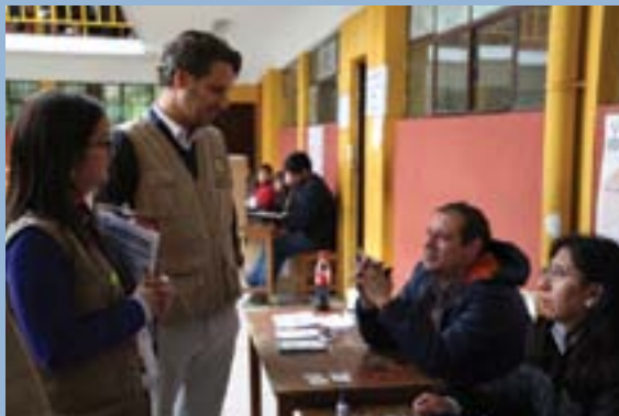
Election Day. La Paz, Bolivia

At the time this document was printed the Final Report had not yet been presented to the OAS Permanent Council.