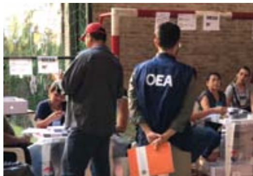
Election Day. Asunción, Paraguay

In the run-up to the 2018 general and departmental elections, on December 17 political parties that comprise coalitions held internal elections to choose their candidates for the 728 seats up for election in 2018. DECO/OAS deployed a team of electoral specialists that held meetings with the Superior Tribunal of Electoral Justice, the electoral tribunals of the political parties Asociación Nacional Republicana (ANR) and Partido Liberal Radical Auténtico (PLRA), and with the presidential candidates of each of the coalitions. On election day, the delegation visited voting centers in Asunción.