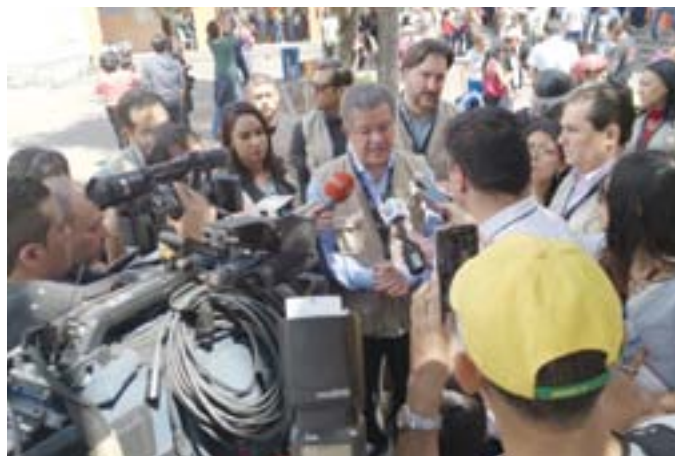
Election Day. Quito, Ecuador