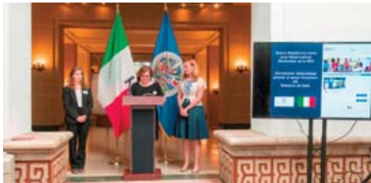
Presentation of the new Online Registry for Electoral Observers by the Ambassador of Italy to the OAS. Washington DC, United States – June 2017