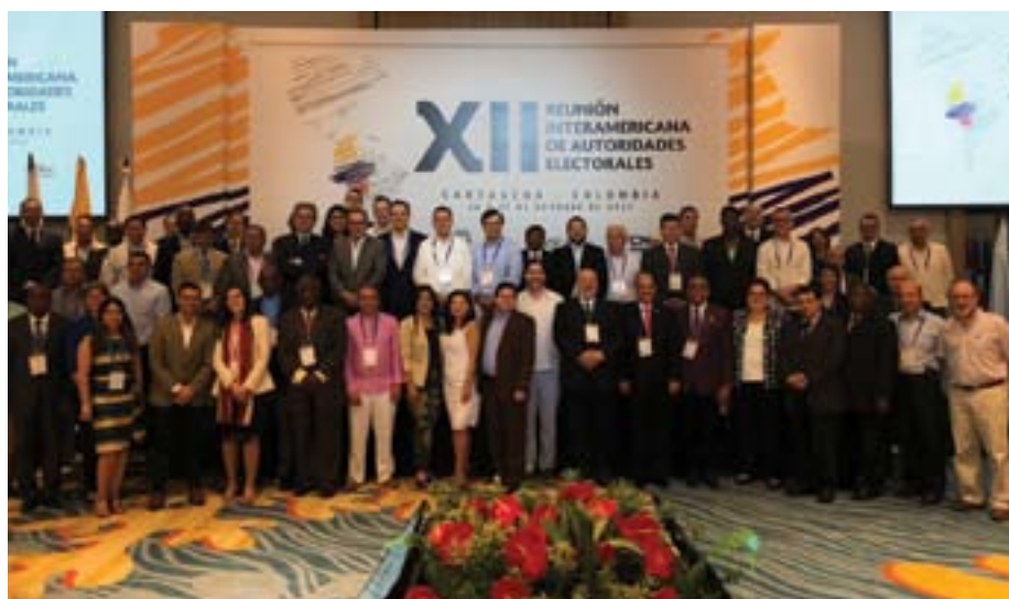
Group picture, XII Inter-American Meeting of Electoral Management Bodies. Cartagena, Colombia – October 2017

What was achieved?: • Sharing of experiences and successful practices in the areas addressed in the meeting. • A strengthened relationship between DECO and the electoral authorities of the region. • Facilitation of horizontal cooperation among the electoral authorities of the region. • Agreement that the Dominican Republic will host the XIII edition of the RAE in 2018. • Participants decided to work on a Code of Electoral Good Practices.