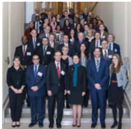
XII Implementation Meeting of the Declaration of Principles for International Election Observation. Washington DC, United States – December 2017

What was achieved?: • The OAS Permanent Council was informed about the efforts made by the OAS and the other signatory organizations of the Declaration of Principles to strengthen electoral processes. • New challenges and opportunities faced by international electoral observation were analyzed. • The capacities of the participating organizations to observe processes of direct democracy, electoral justice and the impact of the internet on electoral campaigns were strengthened. • It was agreed that The Commonwealth will organize the XIII Implementation Meeting of the Declaration of Principles for International Election Observation in 2018.