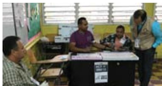
Election Day. Tegucigalpa, Honduras

* http://scm.oas.org/pdfs/2017/CP38551SMOEH.pdf