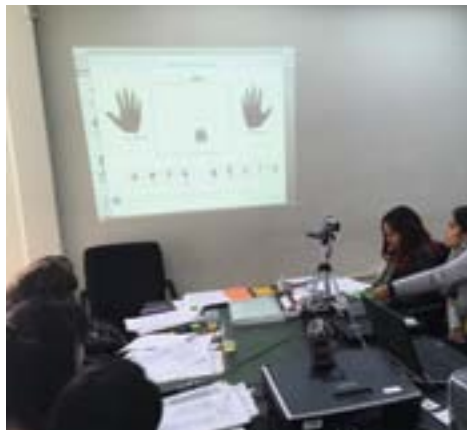
Training of the OAS team prior to its deployment to the 9 departments of the country to observe on the ground the registration processes

Given the particular characteristics of Bolivia and the influence of the plurality of cultures that coexist in the country, the analysis of the legal framework included aspects related to the rights of inclusion of the native indigenous nations and peoples.