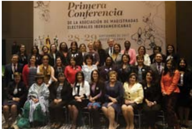
First Conference of the Association of Women Electoral Judges of the Americas. Bogotá, Colombia - September 2017