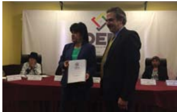
Presentation of the report of the Audit of the Biometric Electoral Registry

At the conclusion of the project, the OAS submitted the report of the audit to the Plurinational Electoral Body of Bolivia, which included short, medium and long-term recommendations. Some of these relate to the promotion of a greater role for political organizations in the configuration of the registry, improving the electronic platform used for registration, and strengthening information exchange with the General Service of Personal Identification. In addition, the report suggests improving the process of self-identification and implementing mechanisms for permanent registration and for strengthening inclusion, particularly in consideration of indigenous peoples accessibility to registration.