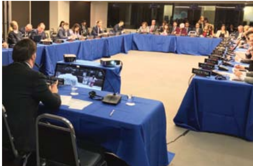
Donor meeting. Washington DC, United States – October 2017

** Nearly all of the Electoral Observation Missions deployed in 2017 were funded with specific funds, but a percentage of the Electoral Experts Mission to Bolivia was covered with regular funds.