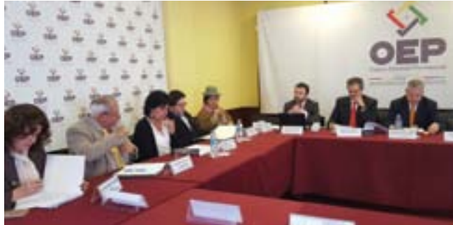
Presentation of the project to conduct a Comprehensive Audit of the Biometric Electoral Registry

On April 14, 2016, the Plurinational Electoral Body (OEP) of Bolivia and the OAS General Secretariat signed a technical cooperation agreement to develop a comprehensive audit of the national biometric electoral registry. This action had been recommended by a number of OAS Electoral Observation Missions deployed to Bolivia.