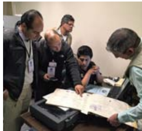
OAS experts observe the process of digitization of historic documents of the civil registry