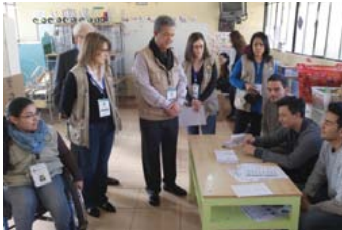
Election Day. Quito, Ecuador

* http://www.oas.org/documents/eng/press/informe-moe-ecuador-2017-en.pdf