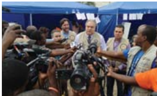
Election Day. Port-au-Prince, Haiti

* http://www.oas.org/documents/eng/press/Informe-Final-Haiti-CP-2017-ENG.pdf