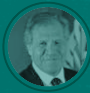
Luis Almagro Secretary General