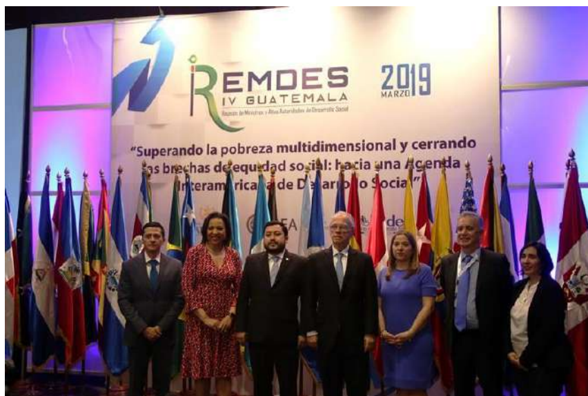
Fourth Meeting of Ministers of Social Development

During the fourth REMDES participants learnt about nine best practices on social policies from the following member states: Brazil, Canada, Colombia, Costa Rica, Chile, Dominican Republic, Ecuador, Honduras and Mexico.