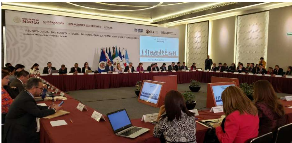
Second Annual Meeting of the MIRPS