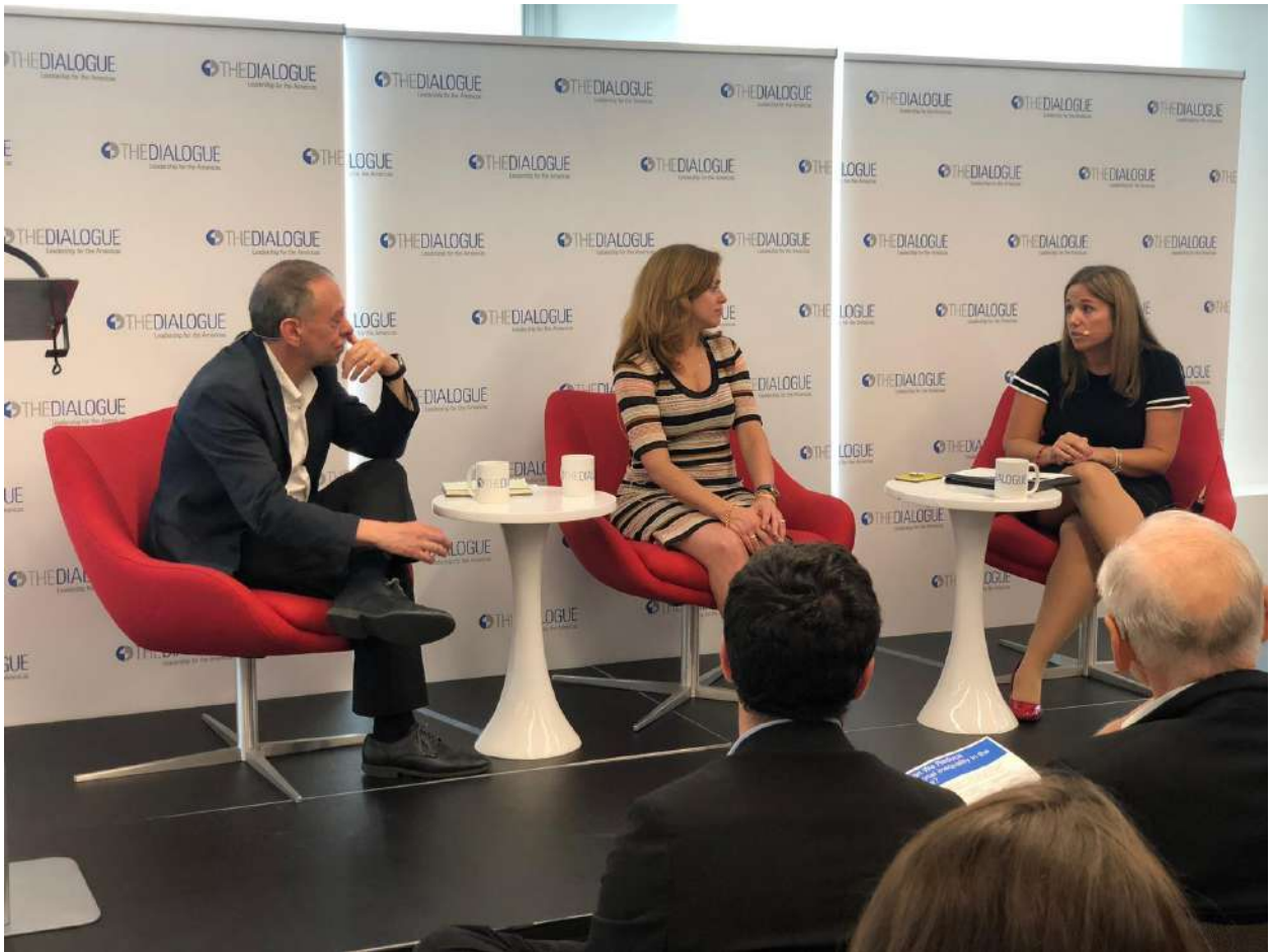
Presentation of the “Interamerican Guide on Strategies for Reducing Educational Inequality”