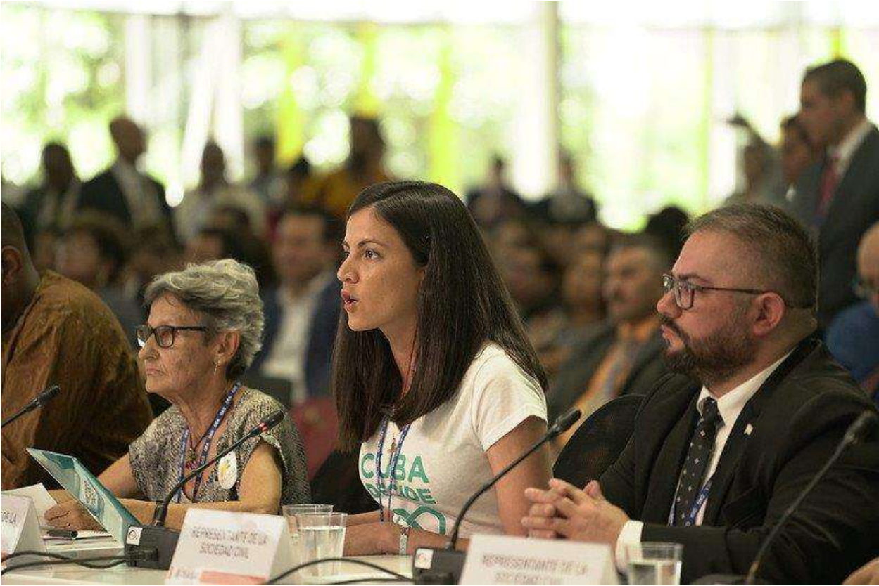
Dialogue of Heads of Delegation, with the Secretary General and representatives of civil society and other social actors